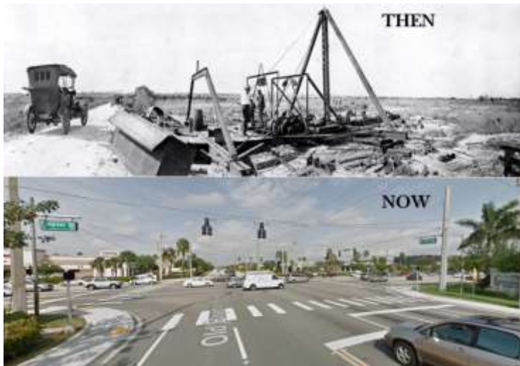
Old Boynton Road, Boynton Beach, Florida