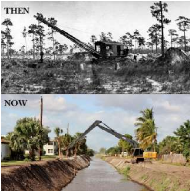
Lake Worth Drainage District maintenance equipment